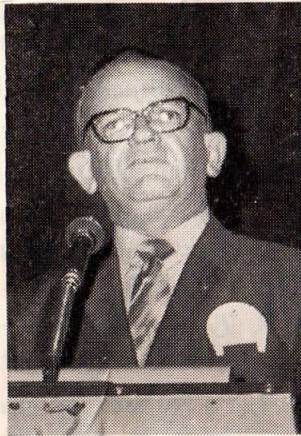
● Deputy Premier of Queensland Sir Gordon Chalk.

There was also a good attendance of wives of members.